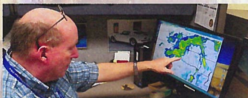
Nuclear Safety Specialist for NNSA's Pantex Plant keeps his eye on the sky as weather spotter