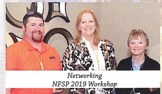
Networking NFSP 2019 Workshop